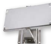
Art.no. 9764 Art.no. 9765