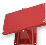
Art.no. 9768 Art.no. 9769