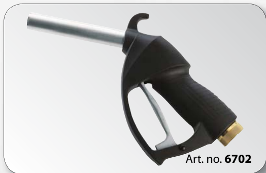
Art. no. 6702

Same as art. no. 6700, but with inlet swivel 1" BSP (M-F).