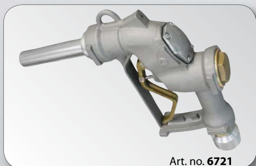
Art. no. 6721