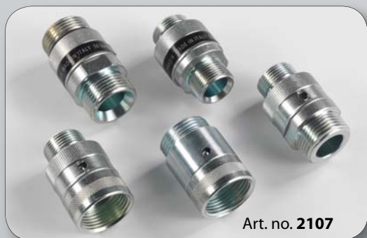
Art. no. 2107