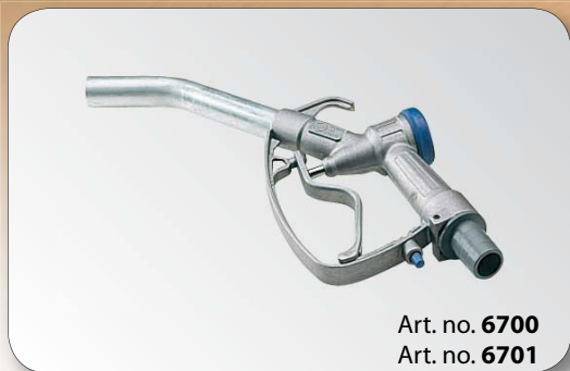
Art. no. 6700 Art. no. 6701