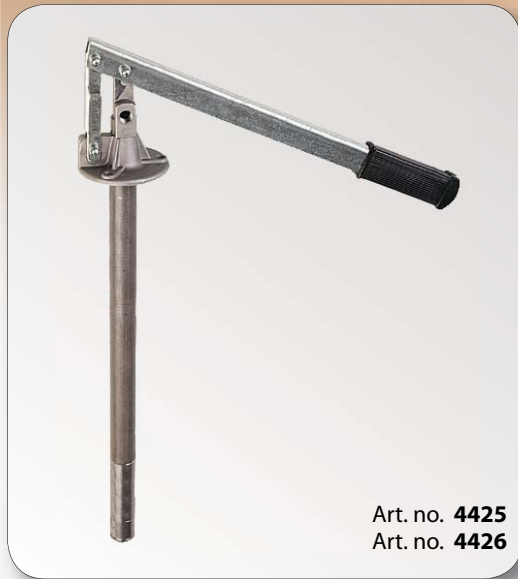
Art. no. 4425

Manual lever action grease pump, suitable for 18/25 kg - pails. Standard suction tube length 360 mm; can be supplied also in different lengths on demand.