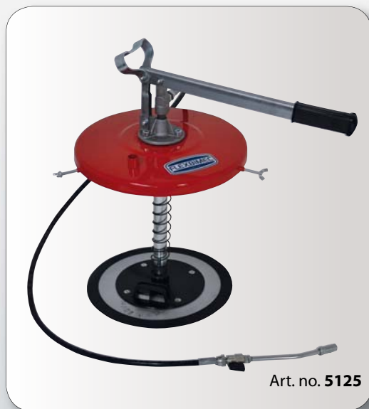
Art. no. 5125

Portable, manual grease supply kit for 18/25 kg – pails, consisting of: