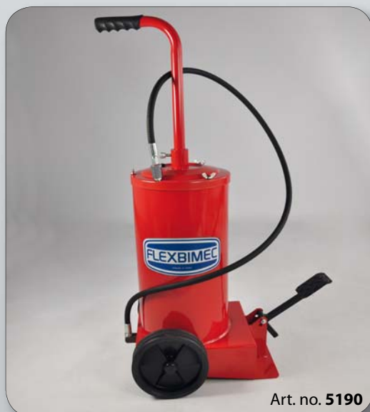
Art. no. 5190

Manual grease supply kit, consisting of metal 16 kg – pail with 2 wheels, pedal action pump, follower plate, ø 230 mm, art. no. 07 5131, 1.5 m – rubber hose R1T, ø 1/4", ball valve and rigid outlet pipe with 4 – jaws – hydraulic coupler.